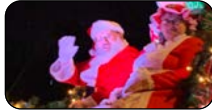
Bright Night Christmas Parade